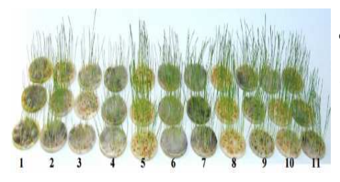
Figure II.5.11. The effect of nitrophenyl derivatives and other compounds at treatment solution concentrations of 5x10-3 M. 1. picric acid, 2. p-nitroacetophenone 3. 2,2 '-bipiridin-3,3',6,6-tetra-carboxylic acid 4. 3,5-dinitrosalicilic acid 5. 2-oxo-2-(4-nitrophenyl) acetic acid 6. 2,4-dinitrobenzoic acid 7. 2-oxo-glutaric acid; 8. 4-nitrobenzoic acid 9. L-phenylalanine; 10. resorcinol; 11. Control sample.

We studied the effect of 2,4-DNP and magnesium sulphate on wheat seed germination. Given the number of sprouted seeds, the difference between samples treated with 2,4-DNP and those treated with a mixture of 2,4-DNP and MgSO<sub>4</sub>, is significant. Perhaps MgSO<sub>4</sub> could be used to treat poisoning with 2,4-DNP (Dumitraş-Huţanu, 2010b, 2010d).